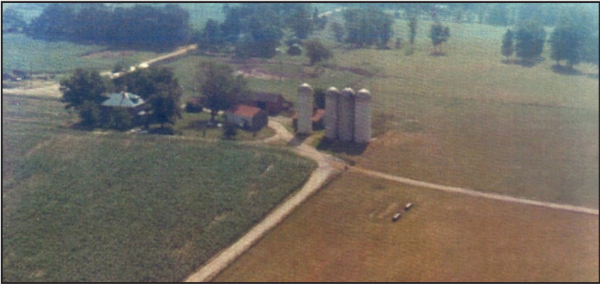
Aerial view of Kinder Farm, 1969.

Gustave acquired 51.75 acres adjacent to the Kinder Cemetery in 1896 and Henry began with an unknown parcel of land near the current farmhouse in 1902, later adding many more acres to his holdings until he reached about 600 acres in 1952.