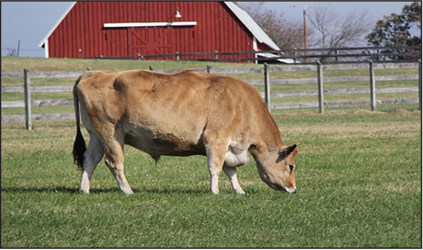
A steer grazes in field next to the Large Animal Barn.