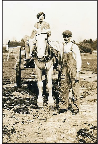
In 1929 the Henry Kinder farm had one mule and one horse to work the farm and pull wagons loaded with produce to market.