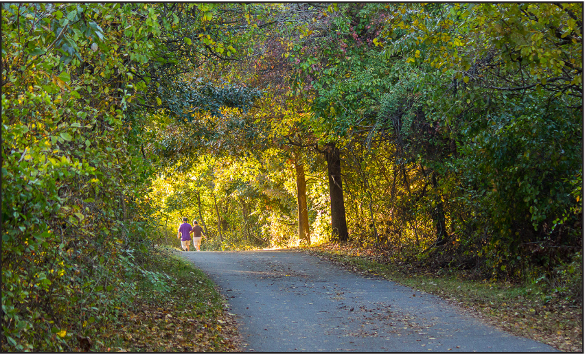
Enjoy 2.8 miles of paved trail through Kinder Farm Park.

Front cover images, clockwise from top left: