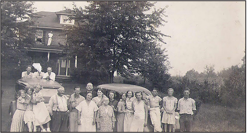
Family gathering in front of Henry Kinder House, 1940.