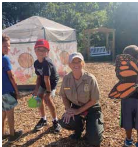
Parks and Trails, pg 32