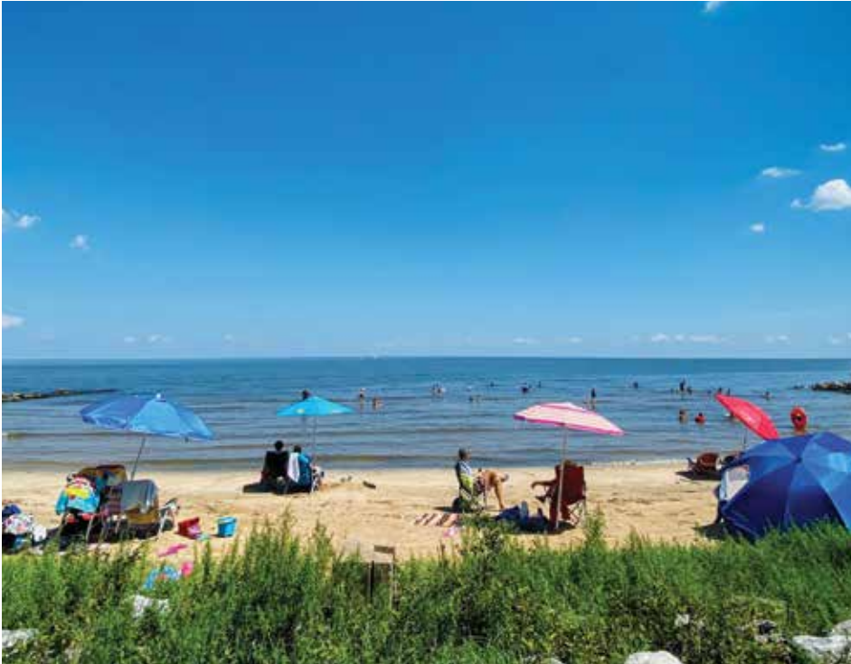
Summer time at Fort Smallwood Park, Pasadena

Visit www.aacounty.org/recparks online Calendar of Events for detailed information about each park program and event.