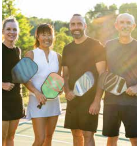
Adult pickleball, pg 9