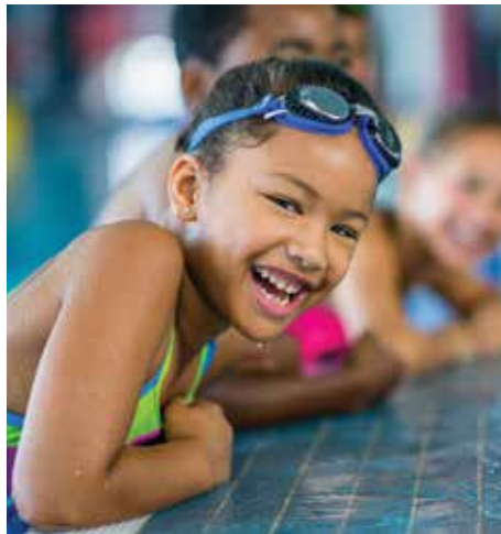
Aquatics, pg 14