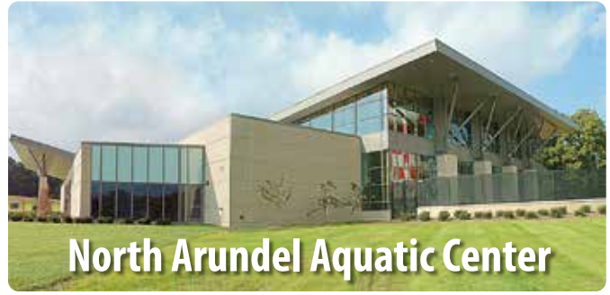
North Arundel Aquatic Center

7888 Crain Highway, Glen Burnie, MD 21061 410-222-0090