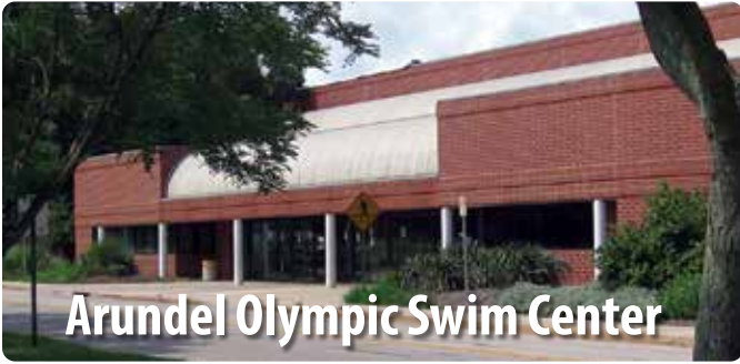
Arundel Olympic Swim Center

2690 Riva Road, Annapolis MD 21401 410-222-7933