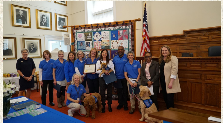
Members of the Caring Canines Courthouse Dog Program, sponsored by Dogwood Acres Pet Resort