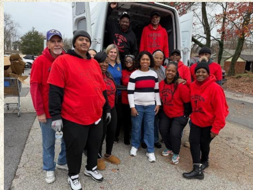
Members of the Empowering Believers Church volunteer twice a month to help their community