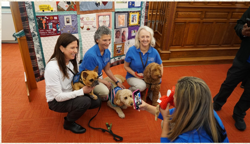
Members of Caring Canines Courthouse Dog Program that accompanies child witnesses to court