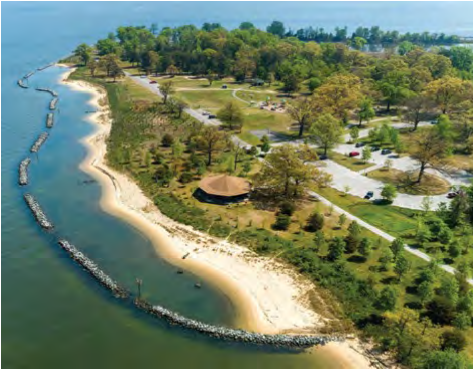
Fort Smallwood Park

Visit www.aacounty.org/recparks online Calendar of Events for detailed information about each park program and event.