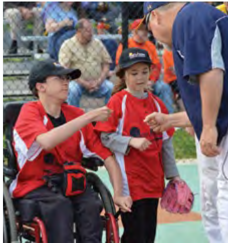
Adaptive pg 11