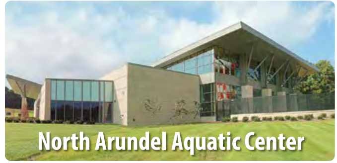
North Arundel Aquatic Center

7888 Crain Highway, Glen Burnie, MD 21061 410-222-0090