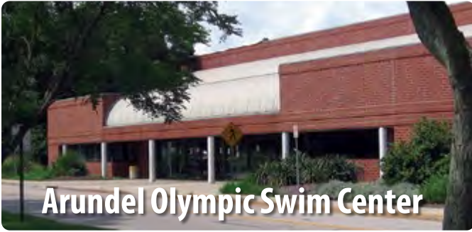
Arundel Olympic Swim Center

2690 Riva Road, Annapolis MD 21401 410-222-7933