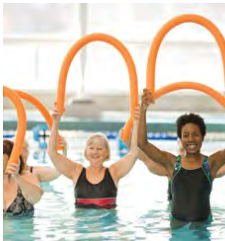
Aquatics Fitness page 21