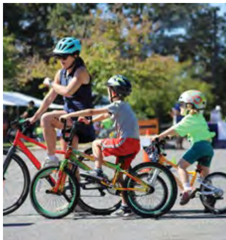
Pedal Power pg 34