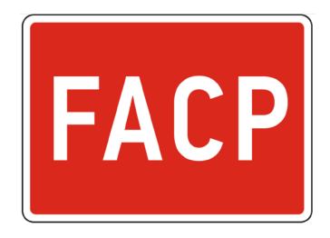
Fire Alarm Control Panel

INTERIOR - Interior Signs shall have minimum 1" lettering.