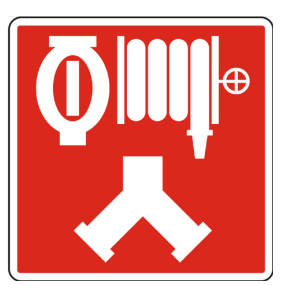
Sprinkler & Standpipe