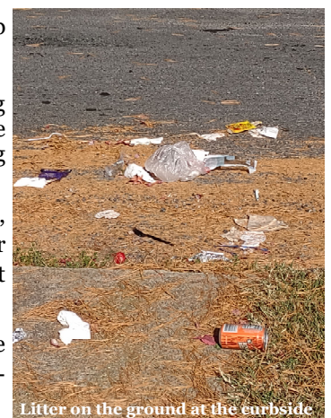
Litter on the ground at the curbside

For additional information about our curbside collection services, please visit https://www.aacounty.org/services/recycling-trash .