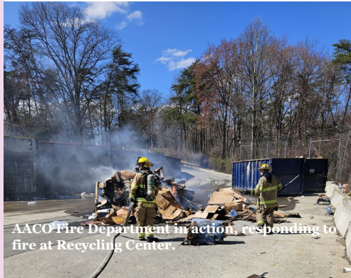
AACO Fire Department in action, responding to fire at Recycling Center.

We're seeing a concerning national trend; an increased frequency of fires in collection trucks and at recycling facilities. Such fires are not only costly due to the equipment and infrastructure damage they cause, fires also pose a significant safety risk to solid waste workers, firefighters, and the public.