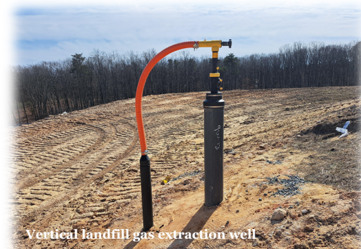
Vertical landfill gas extraction well

cated within Subcell 9.1 were installed by March 2025. The remaining six (6) vertical extraction wells will be installed in October 2025, once waste placement in that area is completed.