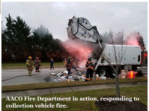
AACO Fire Department in action, responding to collection vehicle fire.

We conduct outreach to educate our residents on "What Goes Where" - www.aacounty.org/what-goes-where — for both our curbside collection program and at our Recycling Centers or Millersville Landfill.