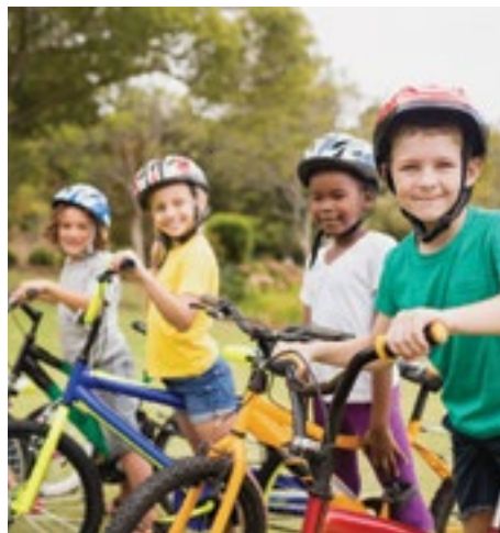
Pedal Power pg 31