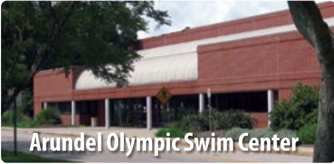
Arundel Olympic Swim Center

2690 Riva Road, Annapolis MD 21401 410-222-7933