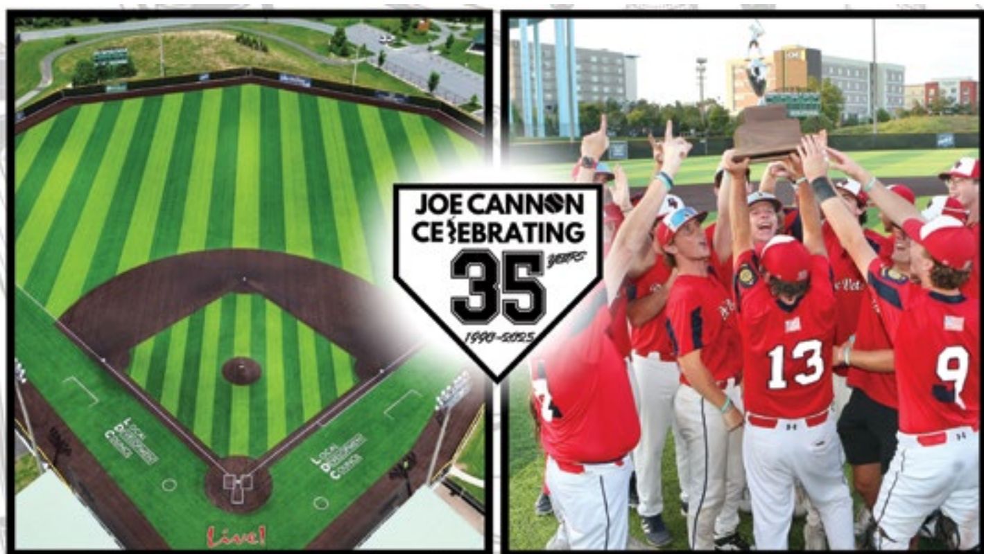
Joe Cannon Stadium proudly marks its 35th anniversary! Check out page 15 to learn more about their adult baseball program!