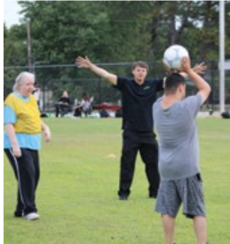
Adaptive pg 11