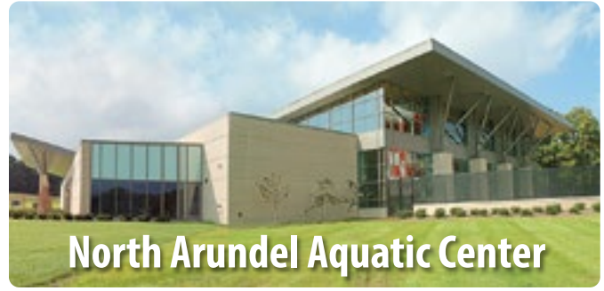
North Arundel Aquatic Center

7888 Crain Highway, Glen Burnie, MD 21061 410-222-0090