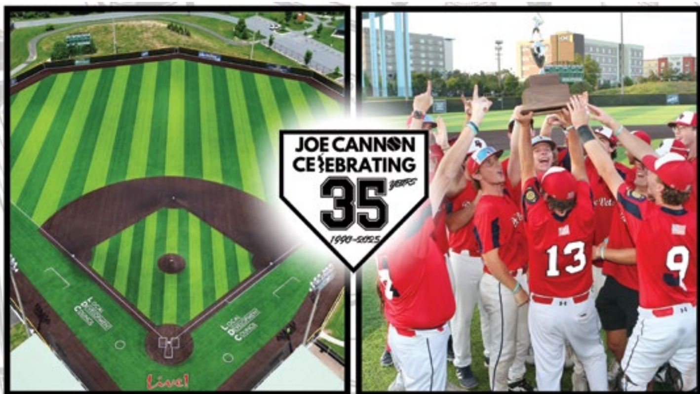
Joe Cannon Stadium proudly marks its 35th anniversary! Check out page 15 to learn more about their adult baseball program!