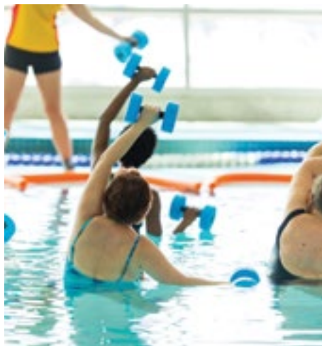
Aquatics Fitness page 22