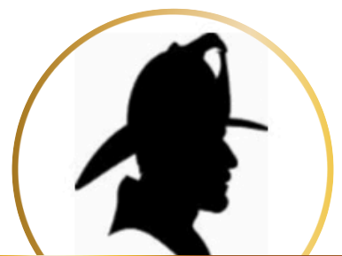
FF Sven Seidel