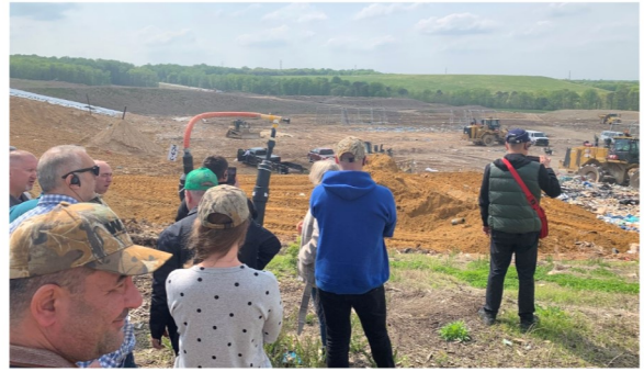
Eurasian delegates observe landfilling operations at MLFRRF

A group of 18 participants from Ukraine, Moldova, Georgia, Azerbaijan, Uzbekistan, Turkmenistan, Kyrgyzstan, and Kazakhstan joined DPW for a talk and facility tour. The delegates consisted of a mix of solid waste managers and business leaders from their representative countries.