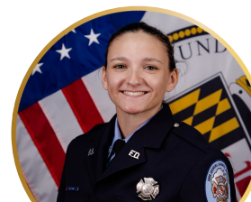
FF Meadow Foor