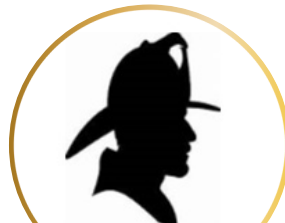
FF III Ryan Vallowe