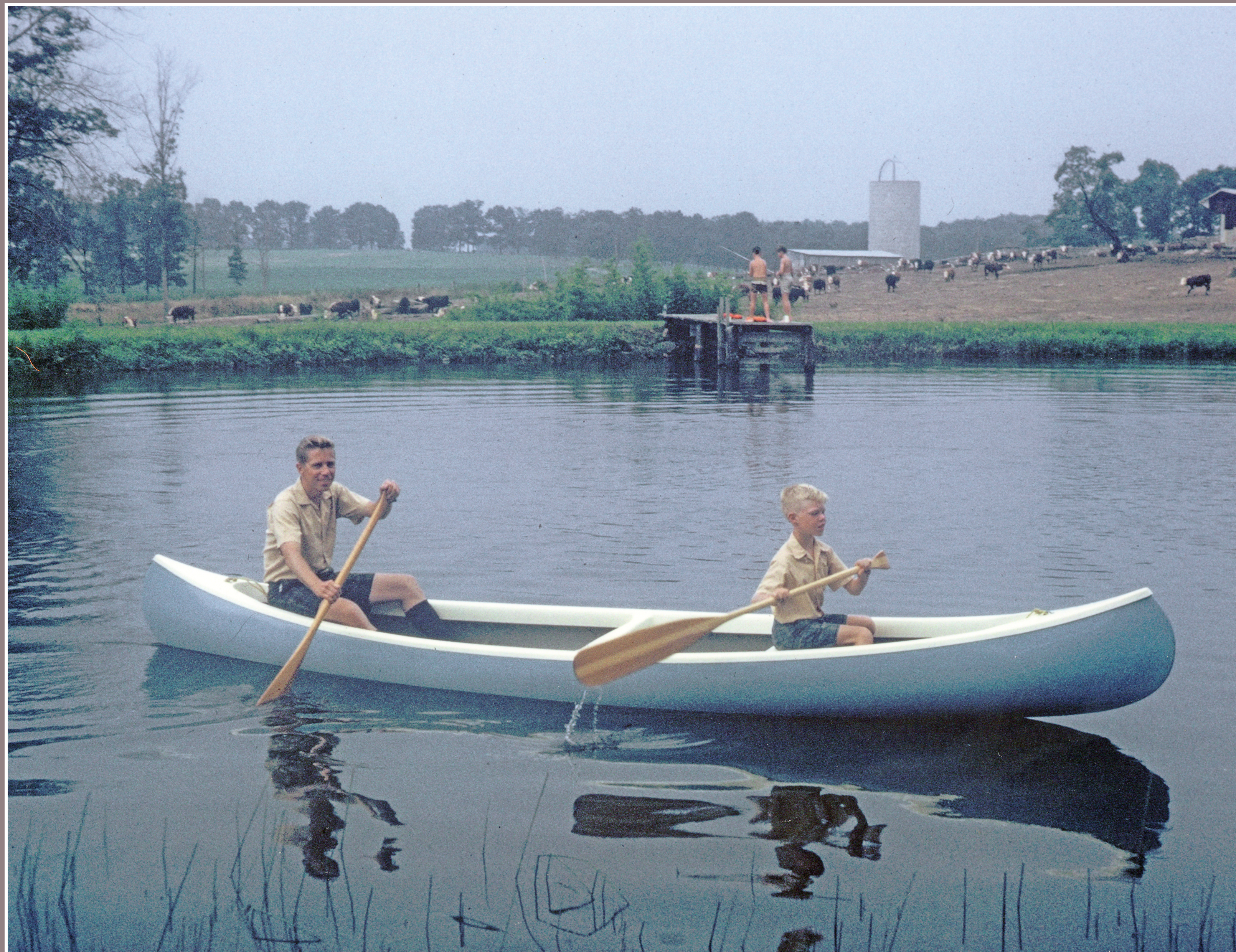
Sunday fun on Bunk's Pond, July 1967

In a secluded corner of Kinder Farm Park is Bunk's Pond.