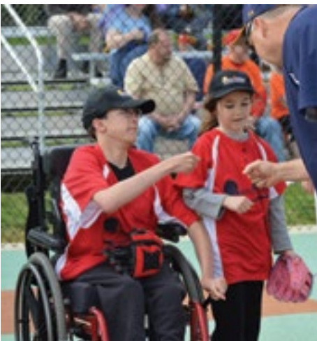
Challenger Baseball, Lake Waterford