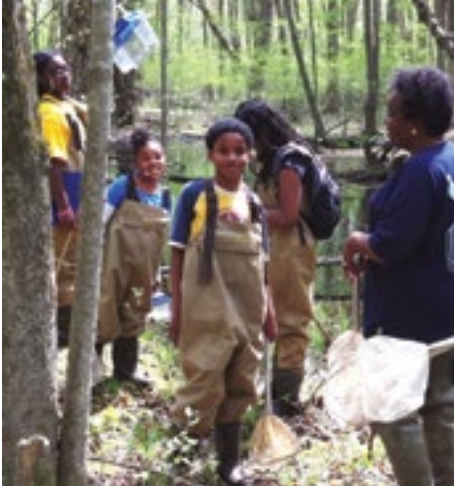
Researching at the Parks

IT'S WORTH A SHOT aaccounty.org/covidvax