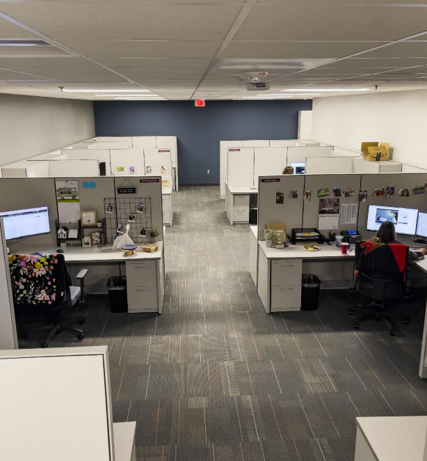
Body Camera Review Office