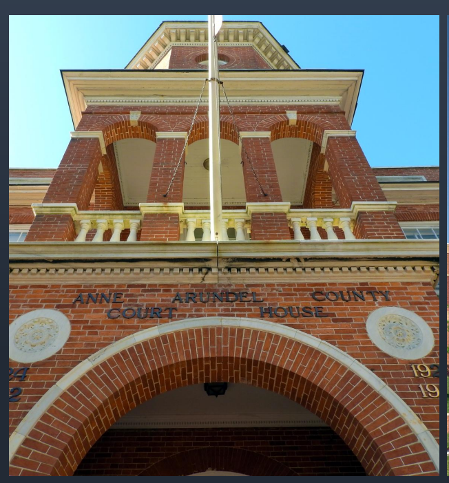
Circuit Court - Main Office