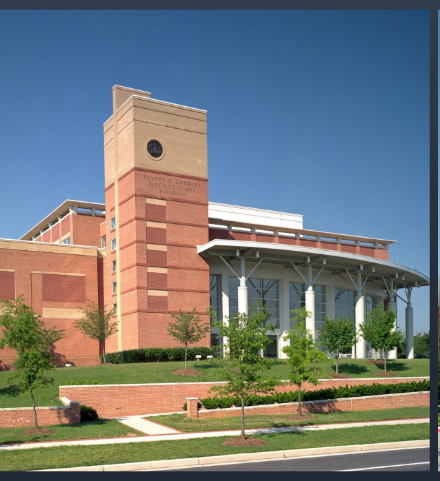
Annapolis District Court