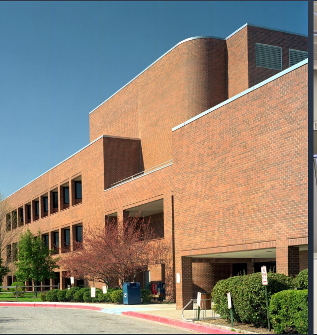
Glen Burnie District Court