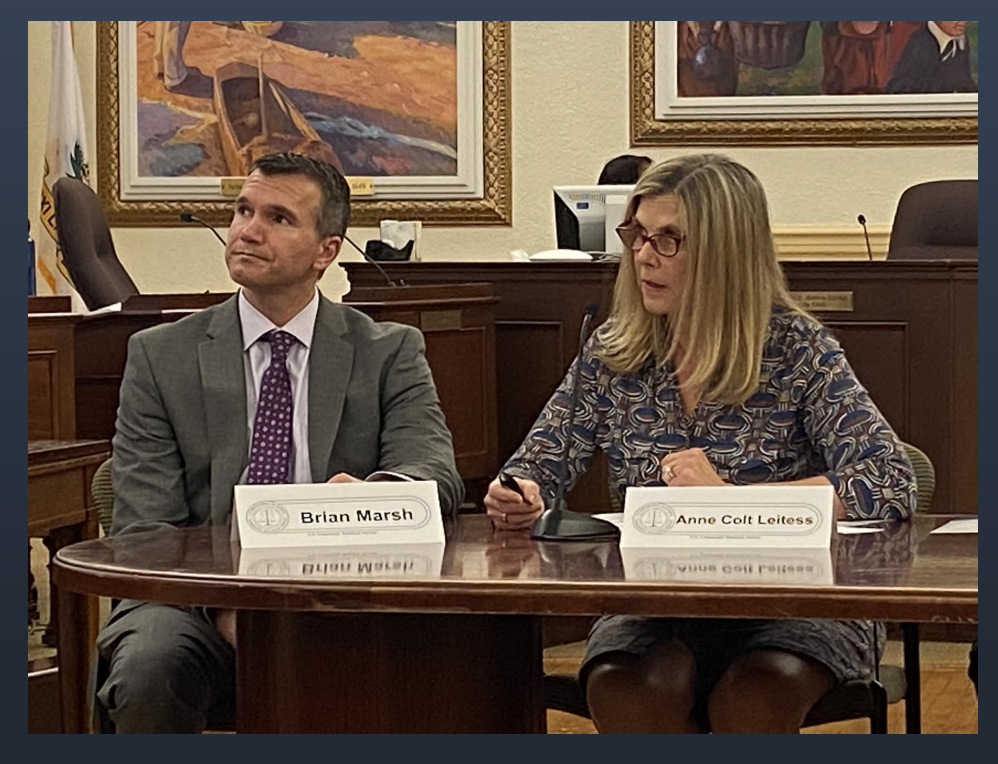
Protecting Places of Worship Forum October 11, 2022