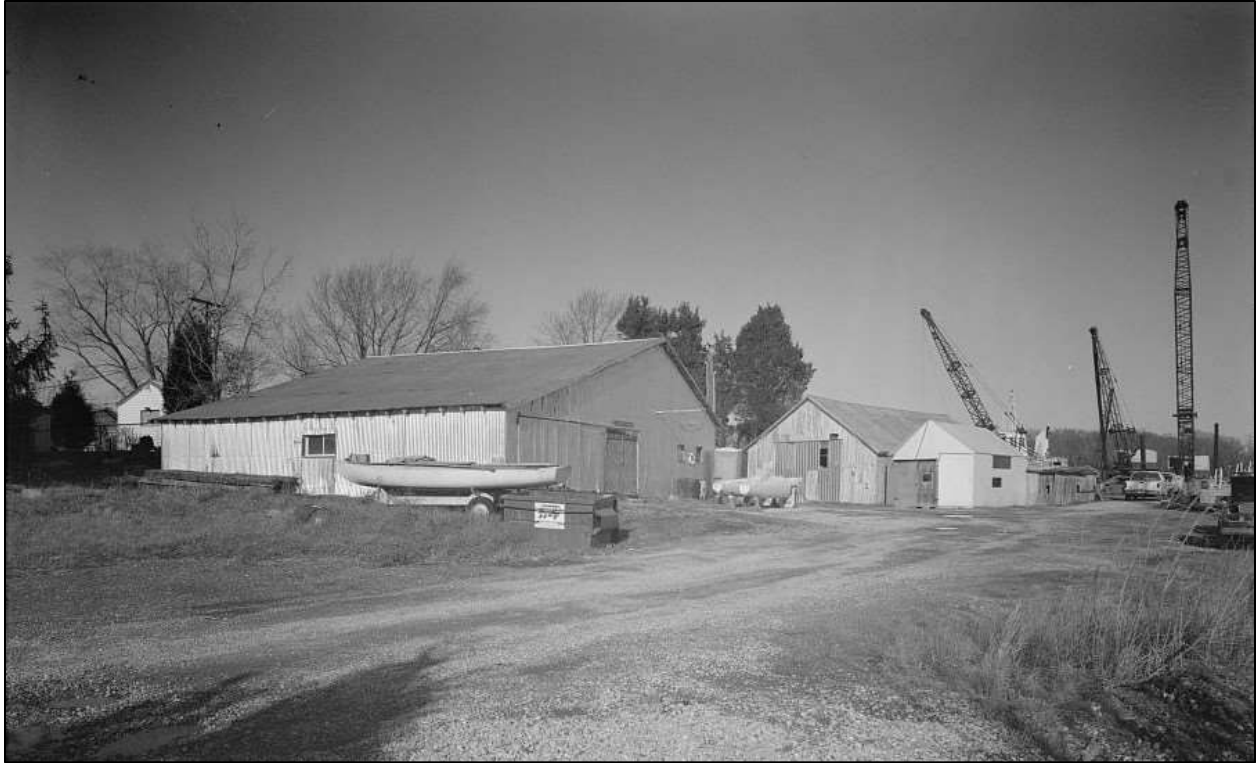
Figure 11 – The shell mill building (left) and the oyster processing building of the F. & H. Benning Company in Galesville. (“F. & H. Benning Company,” Historic American Engineering Survey, HAER no. MD-138, 2007)

amendments favorable to the boat captains, but efforts by the immigrant societies eventually led to federal legislation that protected workers of all nationalities. 95