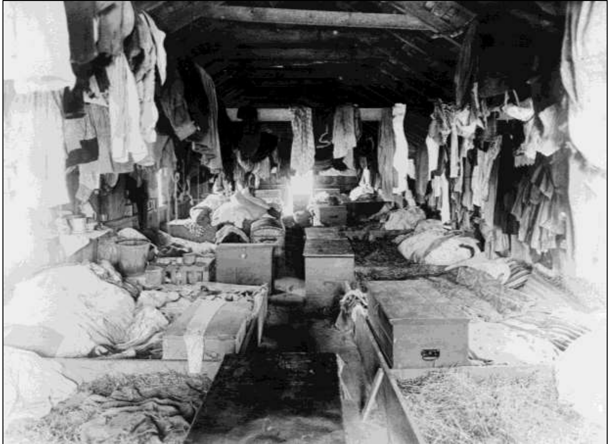
Figure 10 – Pickers’ housing consisted generally of single, open rooms on each floor. Low wood boards divided the family spaces from each other.

the best of the conditions under which they labored helped to make Anne Arundel County one of the largest producers of fruits and vegetables for city markets in the country. 89