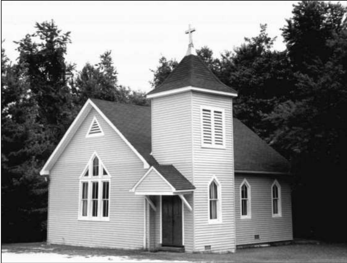
Figure 7 – Christ Lutheran Church in Elvaton was constructed in 1908 to serve the German immigrant population of the area. (“Christ Lutheran Church,” Maryland Inventory of Historic Properties Form AA-1058, September 1996, Maryland Historical Trust website, https://mht.maryland.gov/secure/medusa/PDF/AnneArundel/AA-1058.pdf )

The density of immigrants from the same country sometimes resulted in the development of institutions and the construction of buildings to serve that community. Such was the case with Christ Lutheran Church in Elvaton (AA-1058), another community of German immigrants on the Pasadena peninsula. Lutheran services in the area had been conducted by an itinerant minister in private homes until Rev. F.W. Lowenstein of St. Paul’s Lutheran Church in Curtis Bay began to minister to the Elvaton faithful. Christ Lutheran Church was organized on April 13, 1908, and the cornerstone of the church building was laid in December of that year. Although a new church was constructed in 1965, the original church, called Listman Chapel, remains standing behind the current sanctuary. 79 (Figure 7)