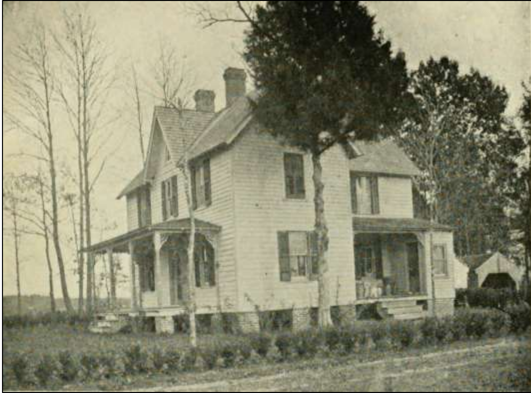
Figure 8 – Among other images, the Maryland Bureau of Immigration used this photo of an Anne Arundel County house to attract potential immigrants. ( The State of Maryland and Its Advantages for Immigrants, Especially Farmers, Manufacturers, and Capitalists . Baltimore: Maryland Bureau of Immigration, 1909, after page 16)