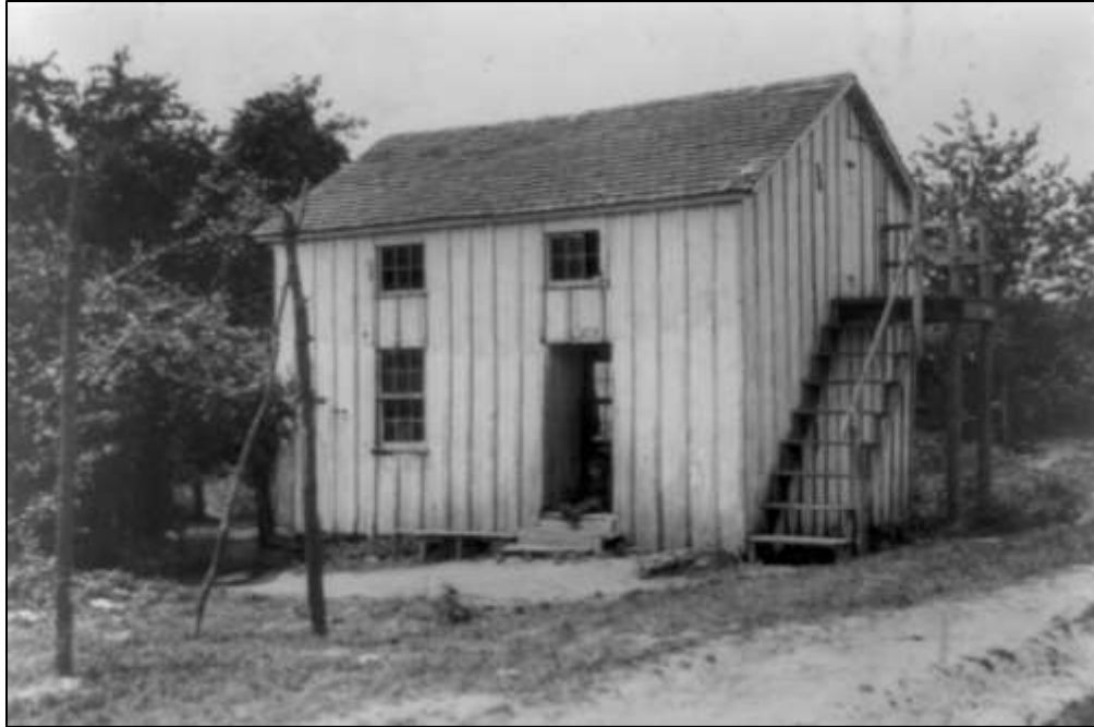
Figure 9 – Summer laborers often lived in two-story “shanties,” like this one on the Bottomley farm in Anne Arundel County.

(Figure 9) Small windows were located below the eaves. Each “shack” might hold four families, and rows of such buildings were constructed on each farm. Fireplaces of mud were built outside, as were wood sheds for food preparation and dining. Newspaper reports in the early twentieth century often suggest happy laborers working outdoors in the sunshine, but the immigrants’ situation could hardly be called idyllic. One newspaper account described the backbreaking work and the difficult living conditions. In this instance, seventy-five people lived in one two-story, 45 by 20-foot wood building in “pens of bedding” – family spaces divided from each other only by low boards. (Figure 10) There were no toilet facilities, although this camp had a well with a pump to provide water, and the owner provided wood for fuel.