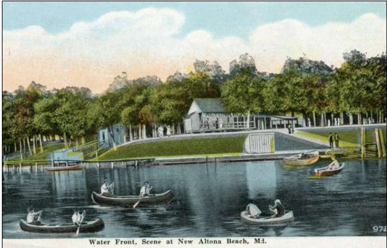
Figure 12 – This postcard, produced around 1920, depicts a building at Altona Beach, a resort community on Stoney Creek.