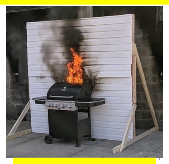
Display grill with wall involved.