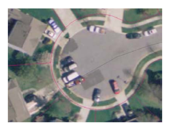
Figure 2 – Parking prevents plowing around the cul-de-sac

The County recommends that no vehicles be parked in the cul-de-sac when winter weather approaches. When snow plow operators encounter vehicles, this causes maneuverability issues and the preferred plowing strategy cannot be implemented. Also, inappropriately parked vehicles on the street leading to the cul-de-sac may impede access to the cul-de-sac.