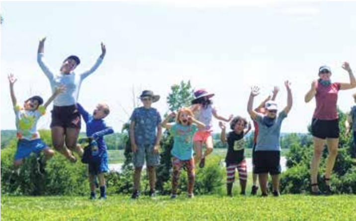
Adventure Summer Camps, pg. 16