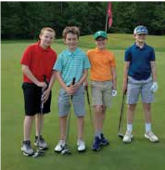
Summer Golf Camps, pg. 12