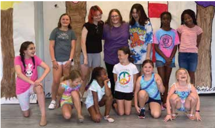
Musical Theatre Camps, pg. 18