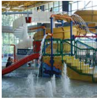
Summer Aquatics Camp, pg. 9