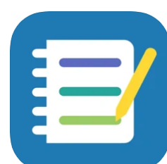
CBT Thought Diary