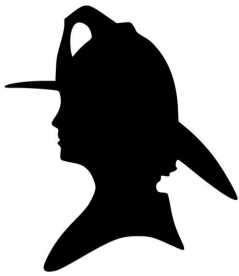
FF/PM Casey Ross