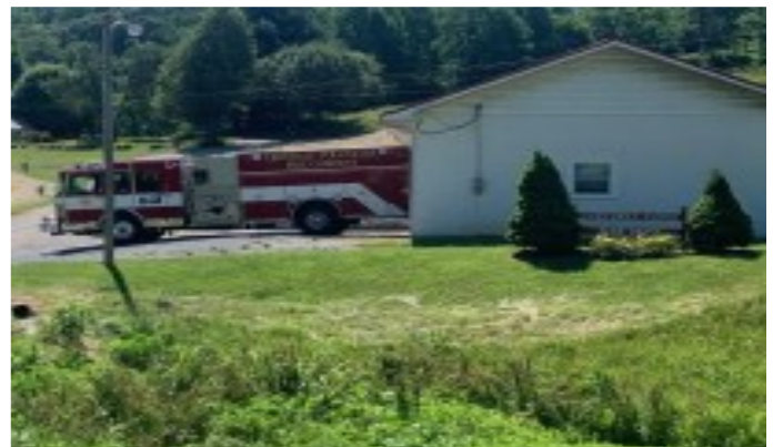
Former Ferndale Volunteer Fire Company Engine 342 at its new home with the Chestnut Ridge Volunteer Fire Department.