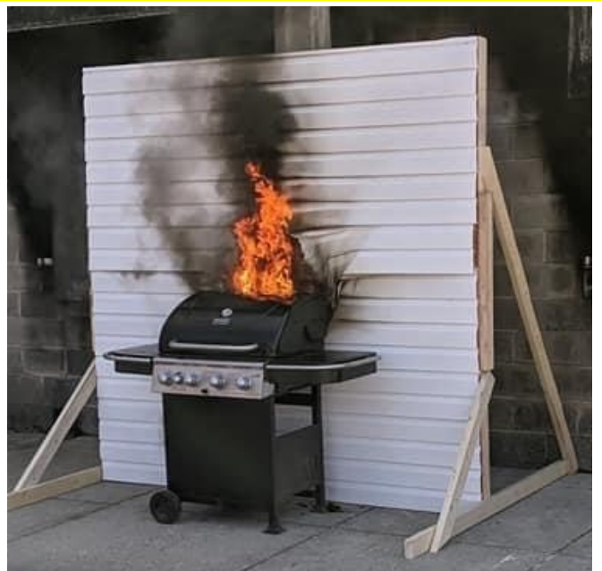
Display grill with wall involved.