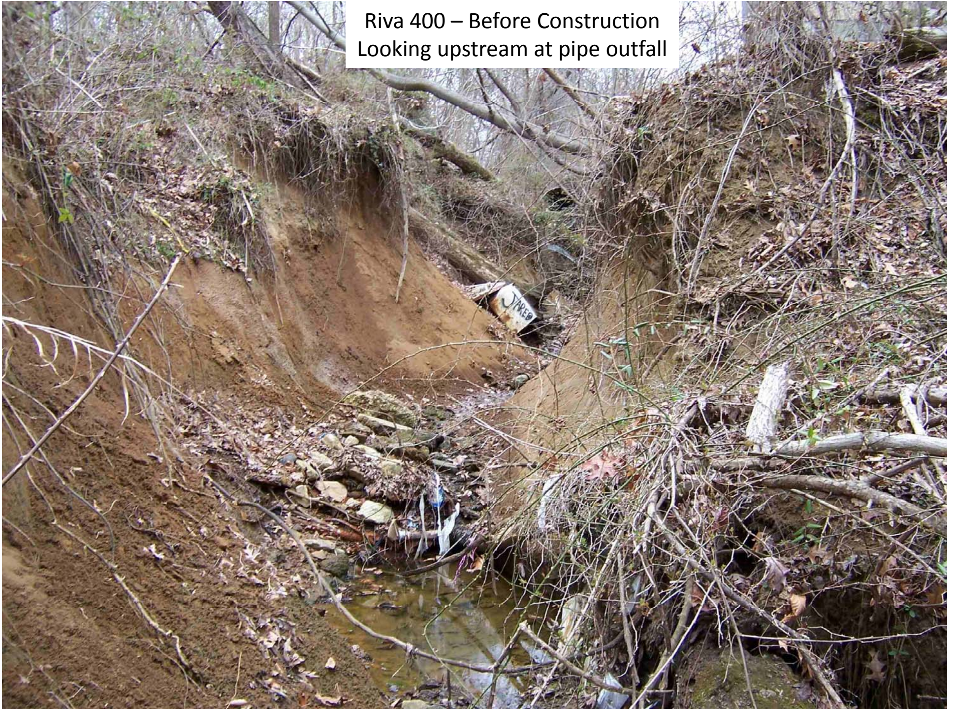
Riva 400 – Before Construction Looking upstream at pipe outfall