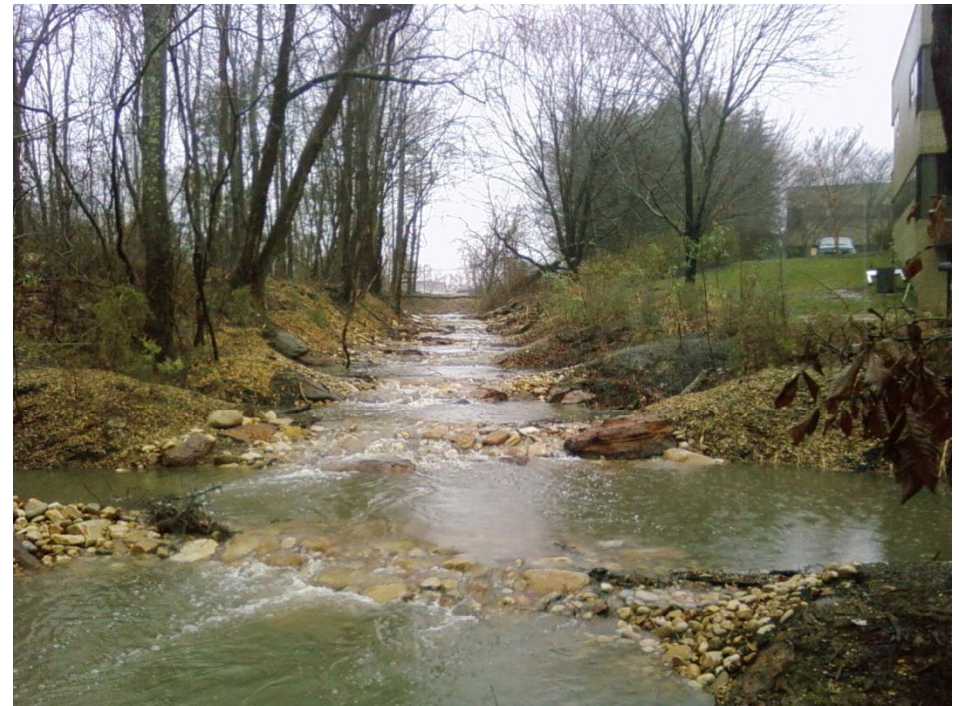
After Restoration Step Pool Storm Conveyance System During rain event Photos taken by: Chris Victoria (March 10/2011)