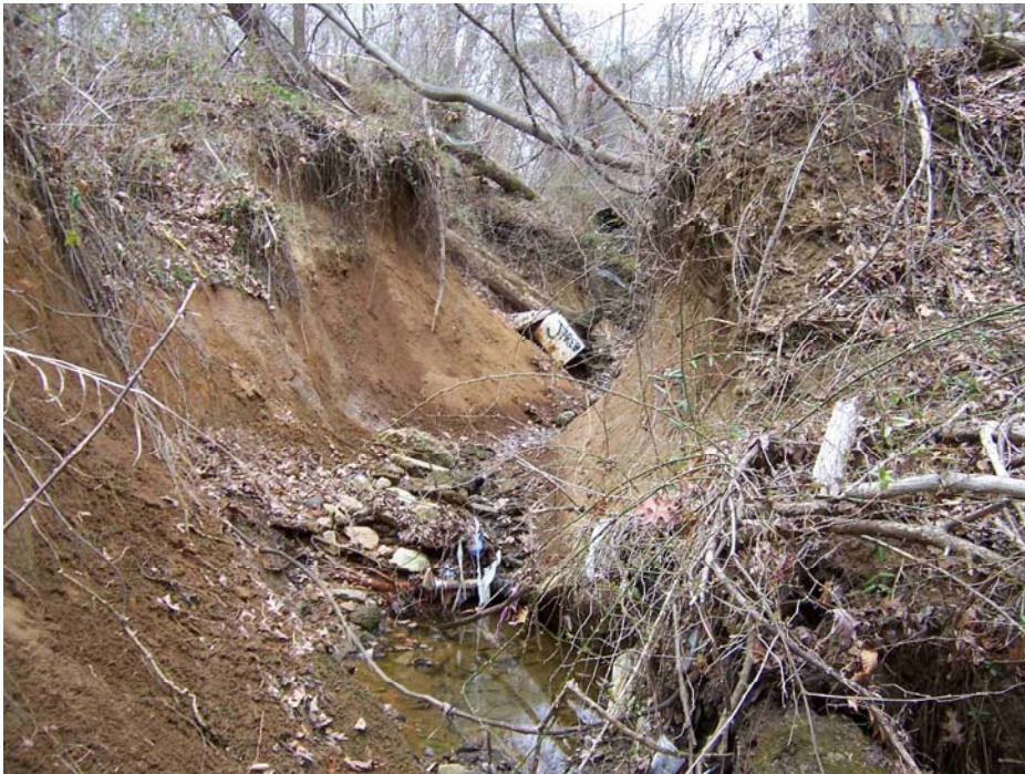
Before Restoration Severely degraded perennial gully during stream assessment South River Watershed Study (March 2006)