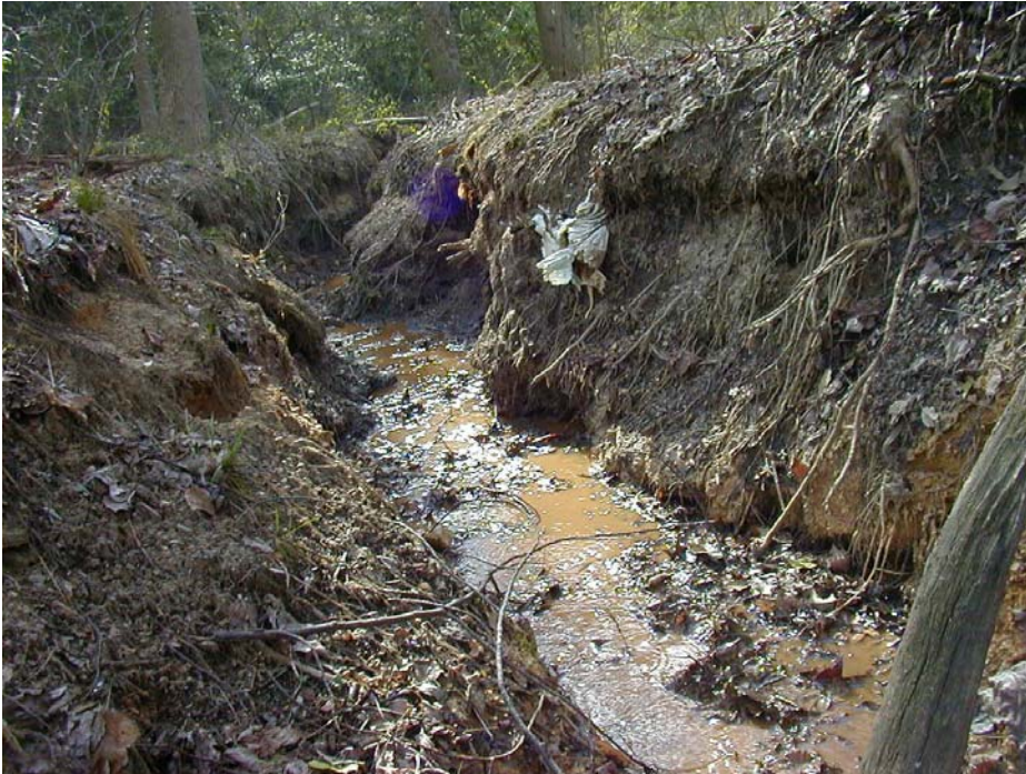
Before Restoration Severely degraded perennial gully Photo take by KCI during stream assessment Severn River Watershed Study (March 2004)