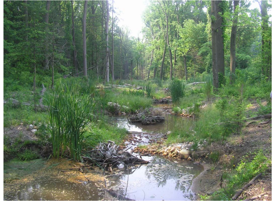
One year after Restoration Regenerative Step Pool Storm Conveyance System Photos taken by: Hala Flores (June 1/2011)