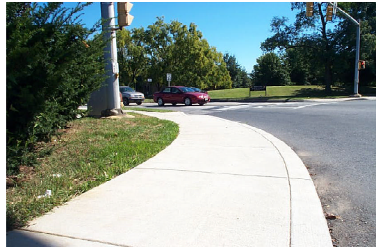
Intersection of Rowe and Taylor Ave. No ramp access.

Current design guidelines recommend that two curb ramps be installed on each corner of an intersection to make street crossings accessible in both directions. At many intersection corners only one curb ramp exists to serve pedestrians crossing in both directions or only serves one direction of travel. On the southeast corner of the Taylor Avenue intersection there is a depression in the curb for the east west crossing, but no sidewalk or ramp exists.