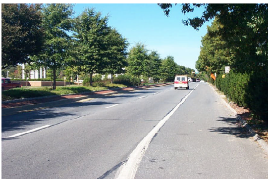
Heading west, before the Taylor St. intersection

Rowe Boulevard is a four lane arterial road, with both right-and left-turn lanes added at its intersections with Farragut Road/Melvin Avenue and Taylor Avenue. A ten-foot wide shoulder exists on both sides of the road between the two bridges, except at the two intersections mentioned previously. A raised median exists for the entire corridor, and is approximately 16-feet wide between the bridges and 4 feet wide on the bridges. There are sidewalks along both sides of the road from College Creek to Taylor Ave and in front of the Courthouse. There are no sidewalks from Melvin Ave to the Weems Creek Bridge or shoulders along the bridge. There are also some crosswalks at all intersections, but not for all legs of any intersection. Currently, the only designated bicycle facility on Rowe Boulevard is the section of signed shared roadway on the College Street Bridge. The Rowe Boulevard/Taylor Avenue intersection has been designated by the City of Annapolis as a high priority funding area.