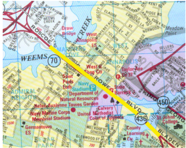
Location Map (Corridor in Yellow)

Rowe Boulevard, in the City of Annapolis is an important arterial road providing access from the County to downtown Annapolis from the northwest. The Navy Marine Corps Memorial Stadium, the Maryland Department of Natural Resources and West II Shopping center are all located adjacent to this one-mile stretch of Rowe Boulevard. Rowe Boulevard is also the only road in Annapolis crossing both Weems Creek and College Creek. The College Creek Bridge is designated as a signed shared roadway and there is significant pedestrian traffic in the corridor. Currently there is a state study in process for this corridor.