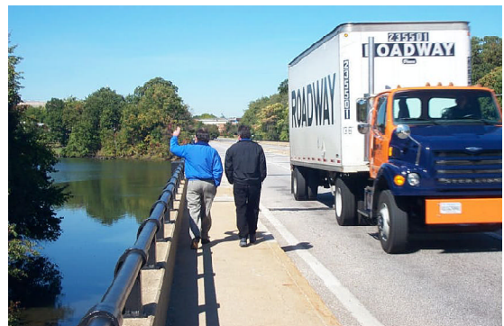
Heading west, on the College Creek Bridge