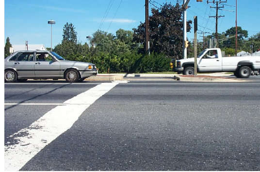
Intersection of Rowe and Taylor Ave. No high visibility crosswalks.

High visibility crosswalks should be located on all four legs of both the Farragut Road/Melvin Avenue and Taylor Avenue intersections. Currently, only three legs of each intersection have crosswalks and the paint on the existing crosswalks has faded.