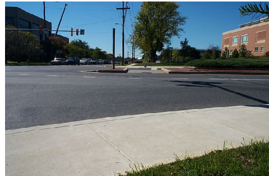
Intersection of Rowe and Taylor Ave. Possible location for pedestrian signals.

Countdown pedestrian signals should be considered at the Taylor Avenue intersection. In addition to the standard symbols used for a pedestrian signal head, a countdown signal has a display indicating the number of seconds remaining in the pedestrian phase of the signal. Cities that have used these signals report that pedestrians find them useful and that the display of time remaining to cross the street is a clearer indication of when it is appropriate for a pedestrian to begin crossing than the standard symbols.