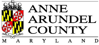
Exhibit 1: Request For a Zoning Line Adjustment

Property Owner: Shortridge Properties LLC